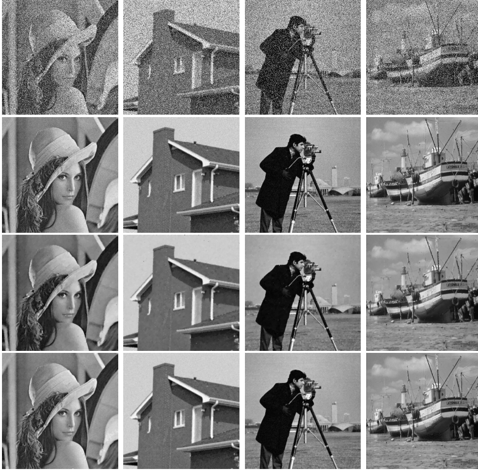
Fig. 5.1: Denoising results of images contaminated by both Gaussian noise and salt-and-pepper impulse noise with \sigma = 10 and s = 30\% . Top row: noisy images; Second row: the results restored by AMF; Third row: the results restored by TVL1; Bottom row: the results restored by total variation blind inpainting using AOP.