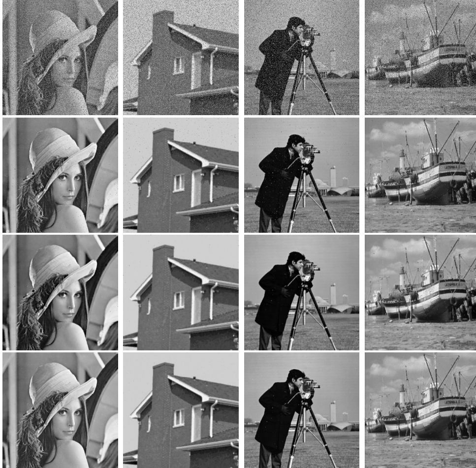
Fig. 5.2: Denoising results of images contaminated by both Gaussian noise and random-valued impulse noise with \sigma = 10 and s = 25\% . Top row: noisy images; Second row: the results restored by ACWMF; Third row: the results restored by TVL1; Bottom row: the results restored by total variation blind inpainting using AOP.

gion and performing image inpainting provides better results in identifying the outliers and recovering damaged pixels. For salt-and-pepper impulse noise, because there are very accurate methods for detecting the corrupted pixels such as AMF, our method has similar performance as two-stage approaches. However, for random-valued impulse noise, there is no method can detect corrupted pixels accurately, especially when the noise level is high. Our method by iteratively updating the corrupted pixels is a better choice.